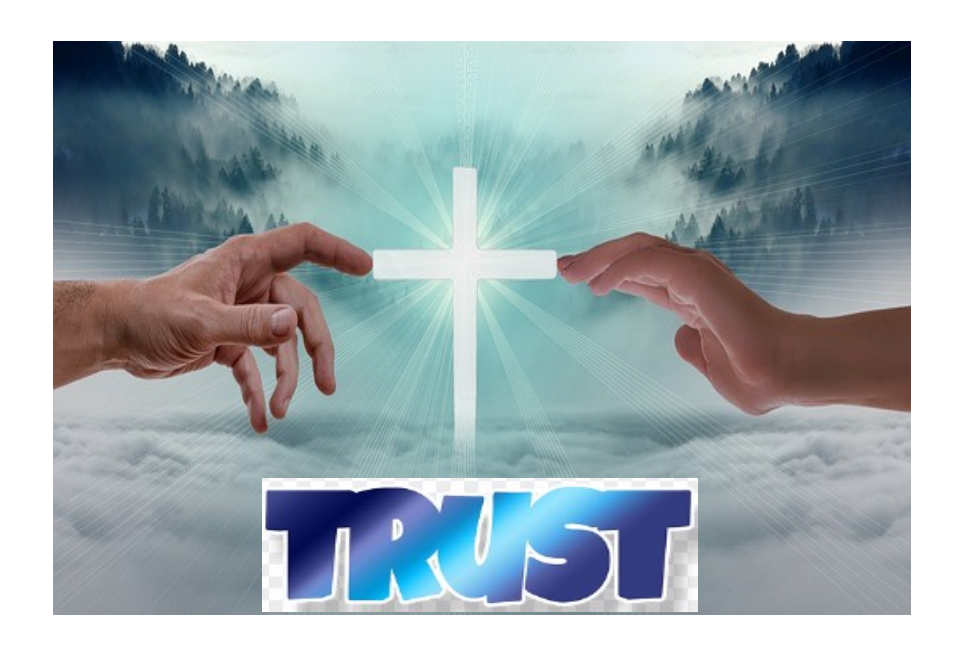
Eighteenth Sunday after Pentecost October 1, 2023

Jesus' parable about two sons who don't do what they say reveals surprises in the reign of God. In the reading from Ezekiel the people claim the ways of the Lord are unfair, while God offers repentance and new life. Paul urges us to look to Christ as a model of humility, putting the interests of others above our own. Nourished by the broken bread and shared cup, we offer our lives for the sake of our needy world.